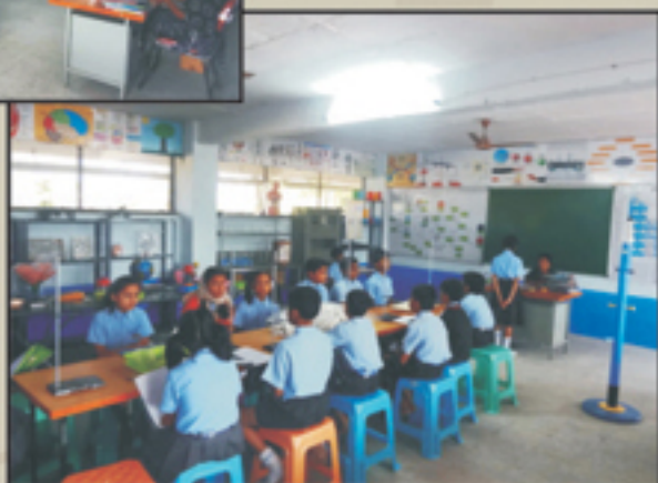
Art & Dance Studio