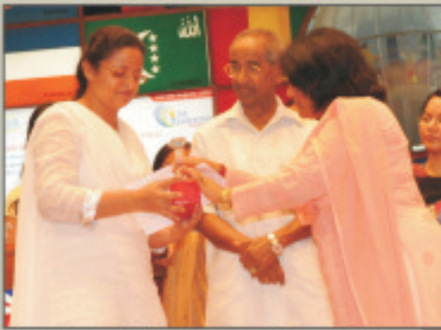
Teaching Ideas Awarded On Global Level