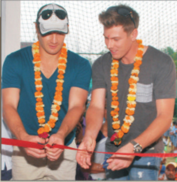
New School Campus Inaugurated by Shane Watson & James Faulkner