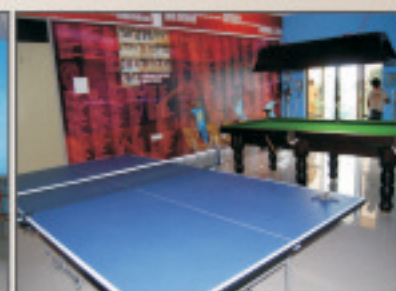
Table tennis in the Recreational Hall