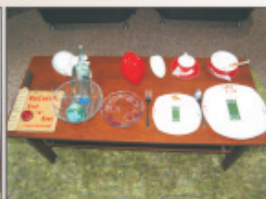
Cricket Conceptualized Crockery